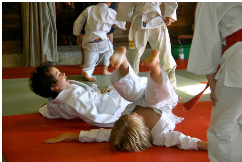
Enjoying a tumble!